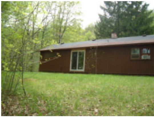
New sliding glass doors in Admin Building