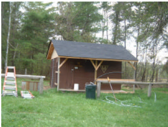
The Tack House at the Ranch after new roof and walls