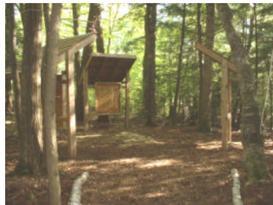
The Remembrance Area