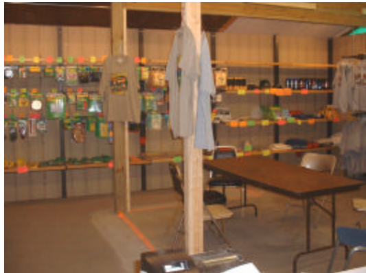
Eddie Bauer shelving inside the Trading Post