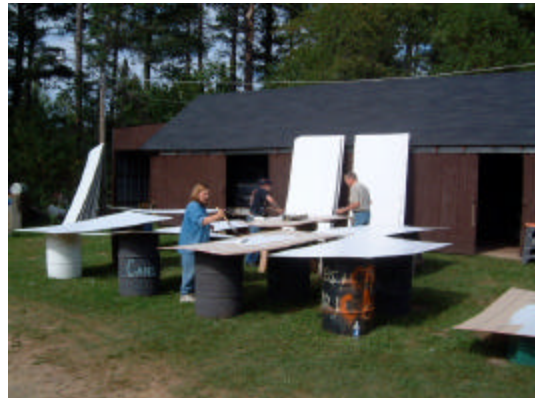
Painting T1-11 sheets for the barn ceiling.