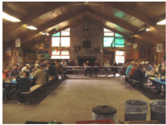
Friday lunch crowd last fall