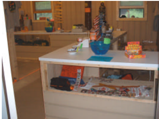
Display cabinet/ counter in the T. P.