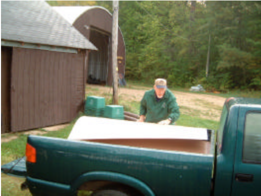
Swannie loads up