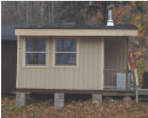
Cabin 5 congrats to all who helped!