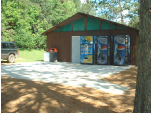
West Trading Post undergoes expansion and improvements

Following a tear-out in the Fall of 2003, the West Camp Trading Post was successfully expanded and redesigned in the Spring of 2004. This was a quick, low-cost project with very dramatic results.