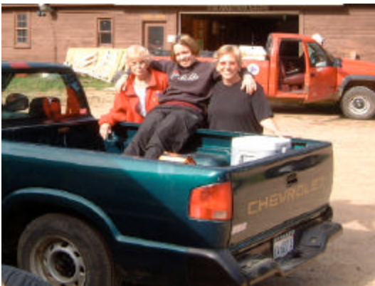
Snack wagon crew ready to go