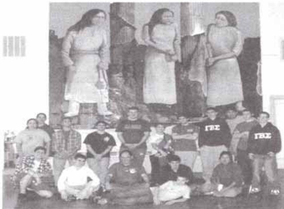
Some of the OA work crew representing the Lodge. We hope to do another project with them in June