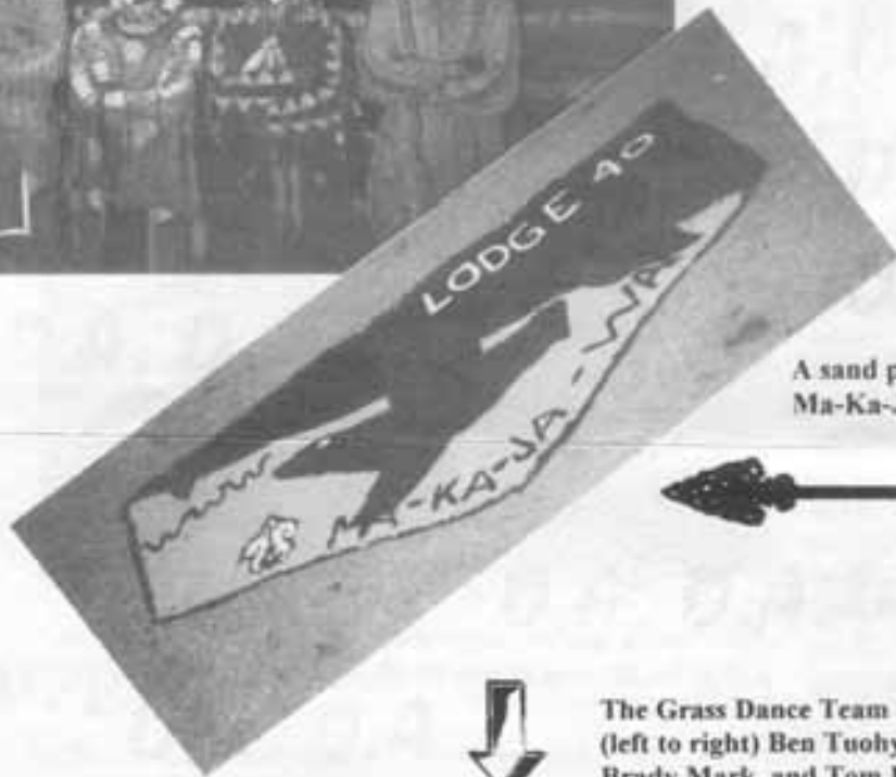
A sand painting of the Ma-Ka-Ja-Wan Lodge flap.

Their dedication to the Order should be of great significance to you. You are encouraged, as fellow Brothers, to exemplify the Order to the best of your ability. Be active and participate in chapter and lodge events. All of which are mentioned in the Whippoorwill.